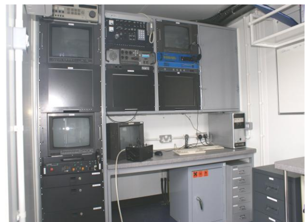
13' Zone 2 ROV Control Container