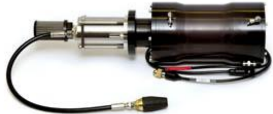
9Kw 120 Bar HP Water jet – Optionally fitted to the Tiger ROV